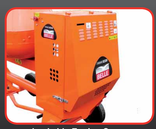
Lockable Engine Cover