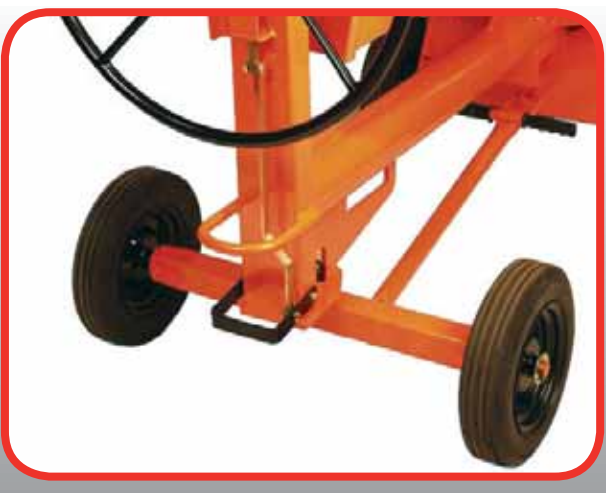
Foot Operated Tip Lock